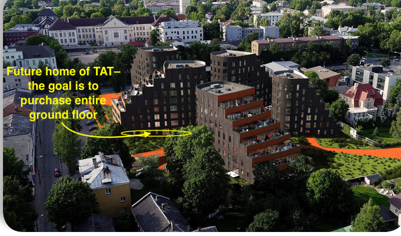
Future view to the entire development.

attempt to get a home for the tive. The plaque stayed there for Academy started in 1994. We 17 years and people derided our