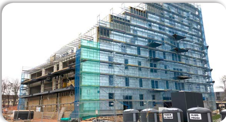
HOME of HOPE construction site on December 1st of 2018.