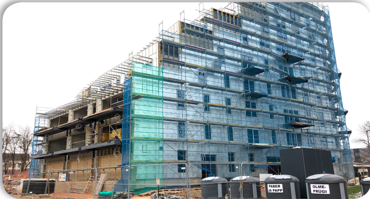
HOME of HOPE construction site on December 1st of 2018.