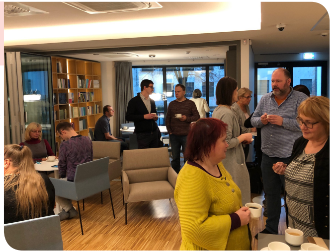
Students having coffee break in main hall and reading room. December 3rd, 2019.

I'm very thankful to all donors and prayerful friends that we have achieved together this important milestone. But the truth is, we still have a long journey ahead of us. Even though donations for HOME of HOPE and Tartu Academy of Theology dropped during the middle of September, we experienced some growth in giving during November and in the beginning of December. I am confident in God and trust the situation will be taken care of, even though at times it seems very difficult and current situation is also one of them. At the end of the year, we have to make the first HOME of HOPE loan payment of $79,596. At the moment we still need $40,415 of it. At the same time, we need also $49,127 to meet TAT's annual budget needs.