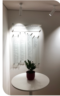
Thank you wall.

Many celebrating with us believe the opening of HOME of HOPE will have a much greater impact on Estonian history than we are able to think about today. Unique vision and people who are encouraged to follow God's footsteps, are making this place very special. This is a ground where we can realize unthinkable ideas. HOME of HOPE was an unreal idea 18