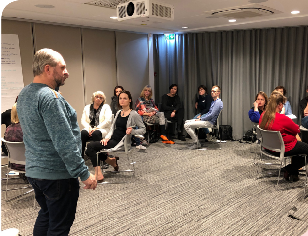
First class in HOME of HOPE on December 3rd, 2019.

On December 2nd we celebrated the dedication of HOME of HOPE. Construction work finished and we were glad to see beautiful results. The Archbishop of the Estonian Evangelical Lutheran Church consecrated the facility in the presence of approximately 100 guests. The service was filled with thanksgiving to God for His great blessings.