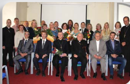
Graduation class of 17, June 2016.

Additionally, the merger has provided for better stewardship of gifts, as the two institutions now share both professors and administrative costs, resulting in a more fruitful preparation of pastoral students and church workers at the graduate and undergraduate levels. Already we are experiencing exciting results as enrollments increase and successful accreditation has been achieved.