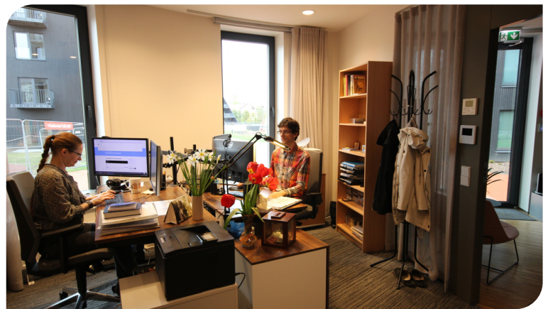
Christian radio office at Home of Hope.