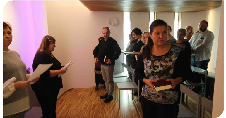
Chapel service before COVID-19.

We have a new website design tatest.org . You'll find lots of pictures, video and much new and interesting information.