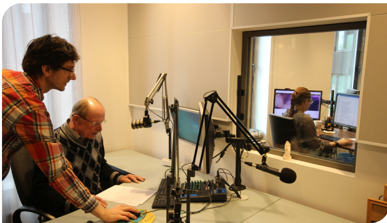
Program recording at radio studio.