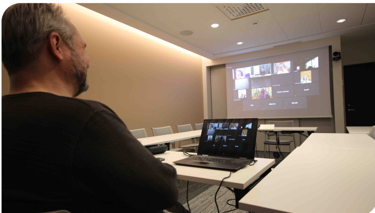
Distance learning in the classroom which is equipped with video conference system.