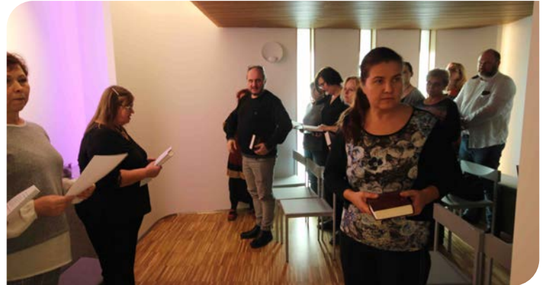
Chapel service before COVID-19.