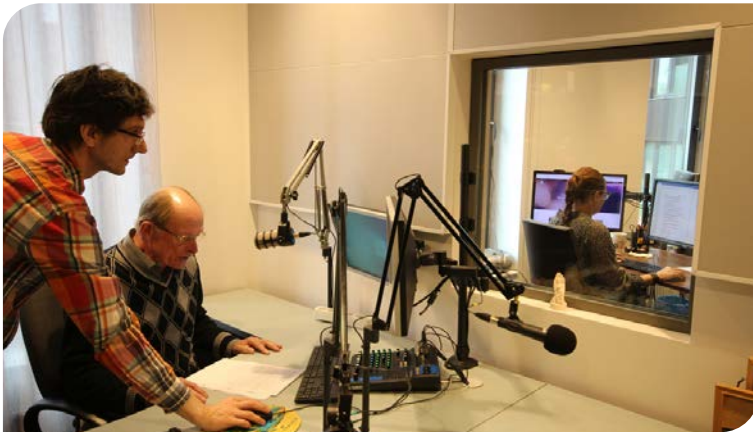
Program recording at radio studio.