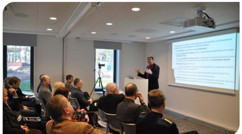
Archbishop of Estonian Evangelical Lutheran Church is speaking at the conference at Home of Hope on February 19, 2020