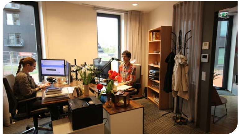
Christian radio office at Home of Hope.