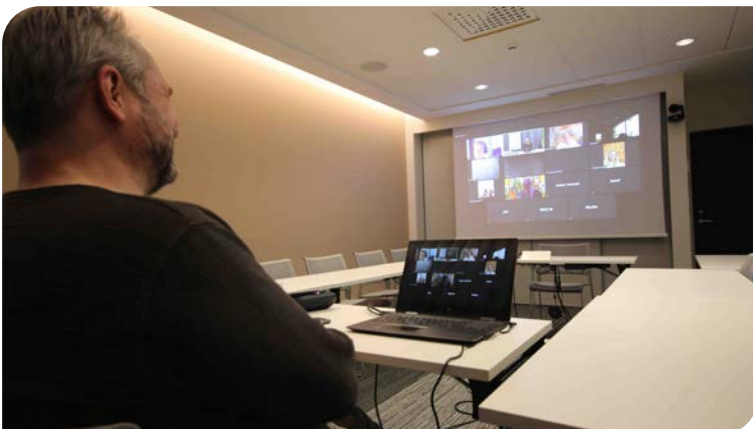
Distance learning in the classroom which is equipped with video conference system.