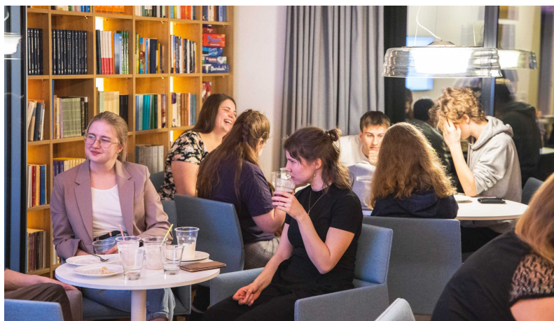
Café with local delicacy and board game table.