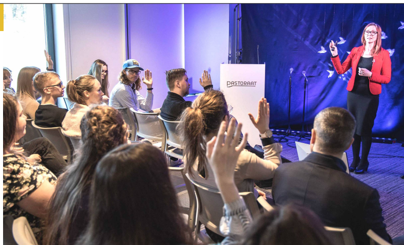
Conference hall with participants and speaker.

The conference was cool. Very actual topics and super speakers! Well executed event.