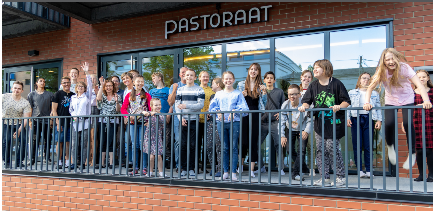
Youth Bible camp attendees in front of Home of Hope.