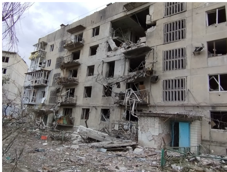
Larysa's home in Severodonetsk after Russian's missile attack.

you give your drops into this huge sea of need.