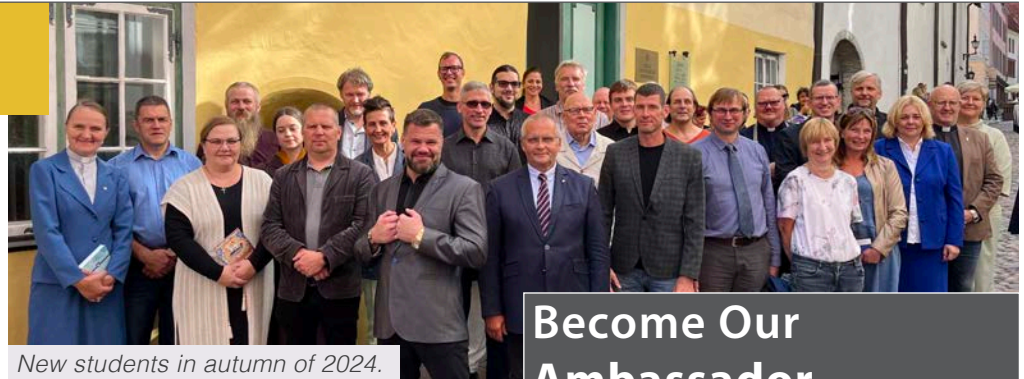
New students in autumn of 2024.

12 students graduated from our joint college; seven bachelor and three master students. Two also graduated from the Church Musician program. Some of the alumni intend to enroll in a master's program in the fall, two are continuing their studies in order to become Lutheran pastors and two are looking for pastoral caregiver positions. The church musicians already work as organists in churches.