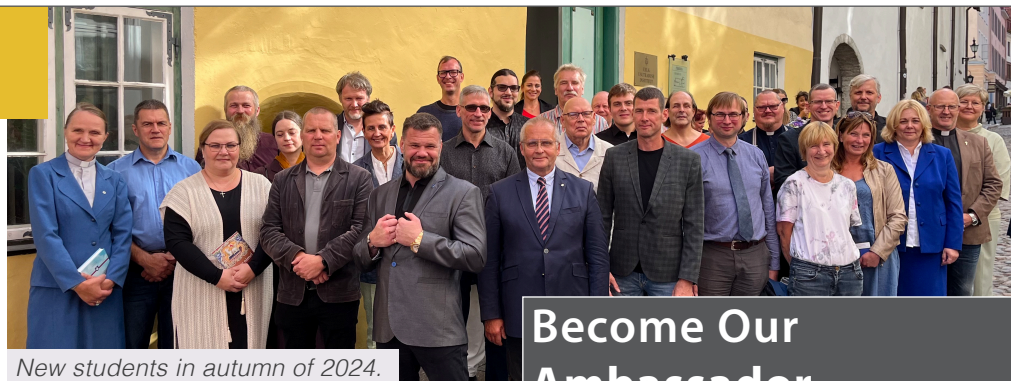
New students in autumn of 2024.

12 students graduated from our joint college; seven bachelor and three master students. Two also graduated from the Church Musician program. Some of the alumni intend to enroll in a master's program in the fall, two are continuing their studies in order to become Lutheran pastors and two are looking for pastoral caregiver positions. The church musicians already work as organists in churches.