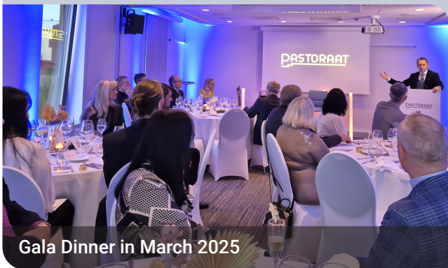
Gala Dinner in March 2025

On March 31, 2025, we held a gala at Home of Hope in Tartu, focused on supporting our pastoral care ministry. Thirty-one guests joined us for an evening of stories, fellowship, and insight into our daily work. Our caregivers shared how this ministry is unique—because we never walk alone. God is present in every encounter, enabling us to bring hope even in the darkest situations.