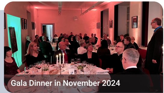
Gala Dinner in November 2024

On November 21, 2024, in cooperation with the Lutheran Church Seminary, we hosted a gala in Tallinn to support theological education. Held in the Seminary's largest classroom, the event welcomed forty-three guests and raised $17,680. Theological education is not a business—it relies on donors to thrive. This event resumed a tradition paused since 2019 due to the pandemic and war.