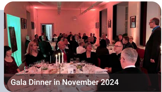
Gala Dinner in November 2024

On November 21, 2024, in cooperation with the Lutheran Church Seminary, we hosted a gala in Tallinn to support theological education. Held in the Seminary's largest classroom, the event welcomed forty-three guests and raised $17,680. Theological education is not a business—it relies on donors to thrive. This event resumed a tradition paused since 2019 due to the pandemic and war.