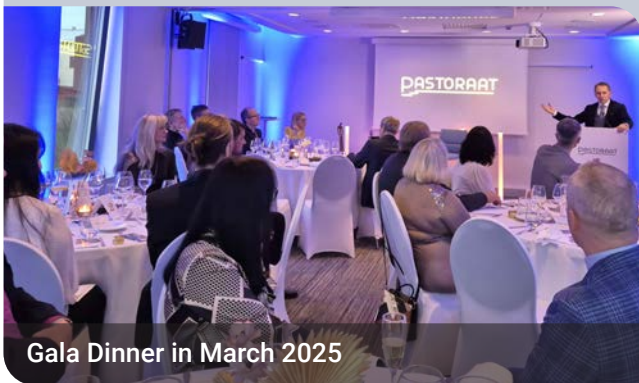
Gala Dinner in March 2025

On March 31, 2025, we held a gala at Home of Hope in Tartu, focused on supporting our pastoral care ministry. Thirty-one guests joined us for an evening of stories, fellowship, and insight into our daily work. Our caregivers shared how this ministry is unique—because we never walk alone. God is present in every encounter, enabling us to bring hope even in the darkest situations.